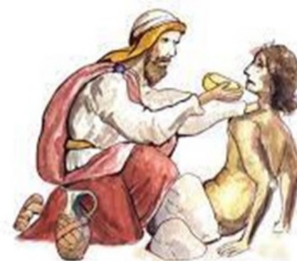
The Good Neighbour Adapted from Luke 10: 25-37

There was a scholar of the law who stood up to test Jesus and said, "Teacher, what must I do to inherit eternal life?" Jesus said to him, "What is written in the law? How do you read it?" He said in reply, " You shall love the Lord, your God, with all your heart, with all your being, with all your strength, and with all your mind, and your neighbor as yourself. " He replied to him, "You have answered correctly; do this and you will live." But because he wished to justify himself, he said to Jesus, "And who is my neighbor?" Jesus replied, "A man fell victim to robbers as he went down from Jerusalem to Jericho. They stripped and beat him and went off leaving him half-dead. A priest happened to be going down that road, but when he saw him, he passed by on the opposite side. Likewise a Levite came to the place, and when he saw him, he passed by on the opposite side. But a Samaritan traveler who came upon him was moved with compassion at the sight. He approached the victim, poured oil and wine over his wounds and bandaged them. Then he lifted him up on his own animal, took him to an inn, and cared for him. The next day he took out two silver coins and gave them to the innkeeper with the instruction, 'Take care of him. If you spend more than what I have given you, I shall repay you on my way back.' Which of these three, in your opinion, was neighbor to the robbers' victim?" He answered, "The one who treated him with mercy." Jesus said to him, "Go and do likewise."